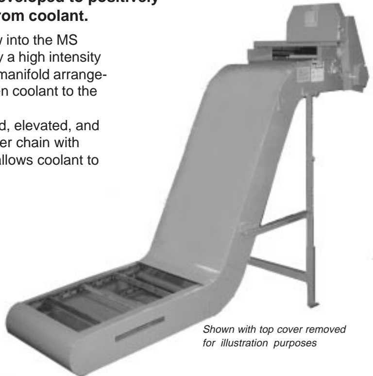
Shown with top cover removed for illustration purposes