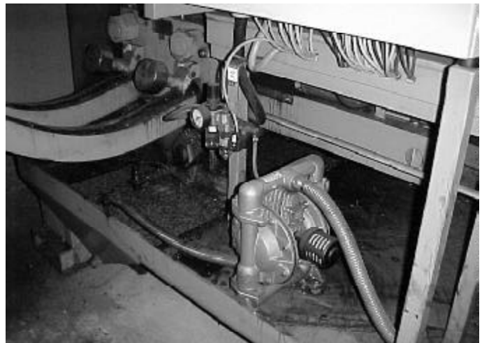
Pump in the coolant tray under the unit transfers coolant and oils retrieved in the briquetting process.