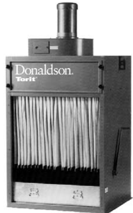
Cabinet 90 (door not shown)